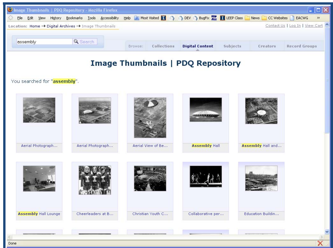
User interface for thumbnail images, v. 2.2